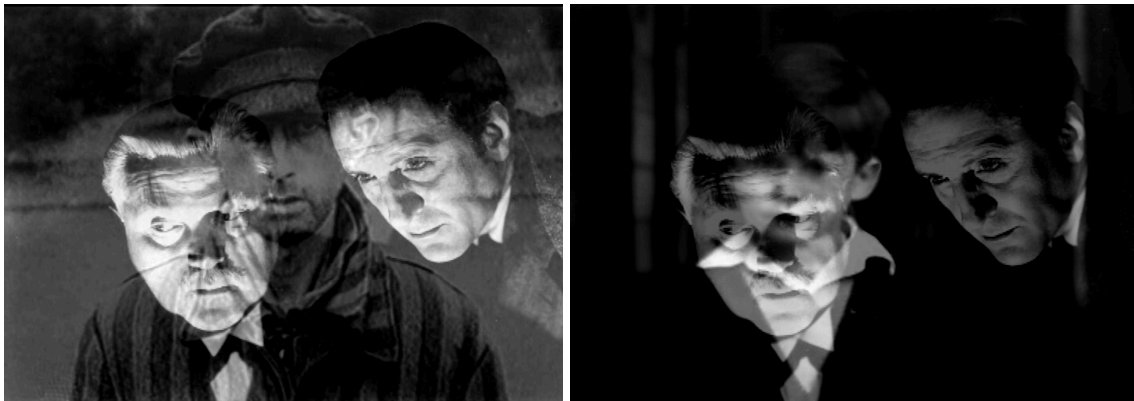
Figure 1. Superimposition between historical reality and fiction. Figure 2. Superimposition between fiction and childhood experience. La Morte Rouge (Victor Erice, 2006). Nautilus Films.

At this moment, the cross-fade becomes the first rhetorical element of this process of indiscernibility. It embodies the shift of fear from fiction to historical reality, that of the Spanish post-war period and the Second World War: ‘for the public The Scarlet Claw was mainly just one more scary film. Except that, in this instance scariness spread forth beyond the screen, prolonging its echo in the ambience of a devastated society.’ Again, the documentary image of the essay film evokes and invokes the fictional creation of The Spirit of the Beehive . What for the adult individual is a leisure activity through which to manage the fear imposed by reality, for the boy, still unaware of the differentiation between fiction and reality, becomes trauma. The cross-fade used between the previous frames is now slowed down to cause the superimposition, and to produce a symbolic sentence-image of it: superimposition between the horror of Nazism and the terror of fiction [Figure 1] and superimposition of that same fictional fear on the face of the boy who will not be able to differentiate them [Figure 2]: ‘Did this universal pain somehow weigh upon the heart of the five-year-old boy who, in the company of his sister –she was seven years older– walked towards the penumbra of a cinema, to see the first film of his life? It is difficult to know.’