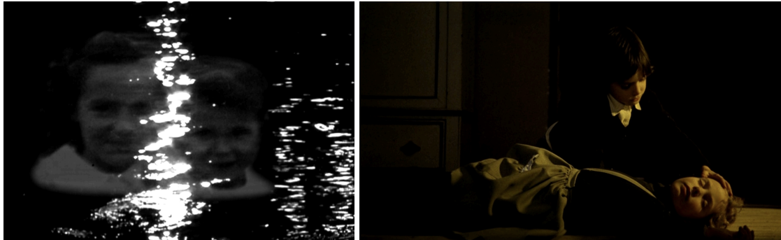
Figure 3. Symbolic sentence-image in La Morte Rouge (Victor Erice, 2006). Nautilus Films.

fiction recreates this transformation and the essay film analyses it, offering an image capable of synthesising it.