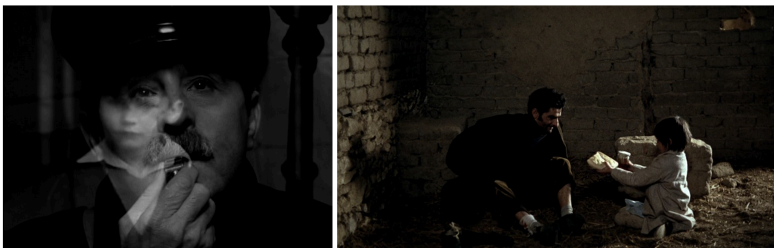
Figure 5. Superimposition between the real image of the boy and the fictional recreation of the postman in La Morte Rouge (Victor Erice, 2006). Nautilus Films.

The actor-postman-murderer from fiction is transferred to reality. The recreation of cinematic terror as a spectator is now completed with the recreation of real and everyday terror. While it was the terror-image of Holmes and Watson that merged with the boy's photo before, it is now the image of the fictional recreation of the postman that occupies that place [Figure5]: 'On hearing it, the boy ran to take refuge in the most out-of-the-way corner of the house.' The boy, therefore, does not face fear, does not overcome trauma. The adult filmmaker he becomes manages it through a fiction in which Ana, his alter ego , does not hide from the spirit (Frankenstein-Potts) nor from its transposition into reality (the maquis-the postman), but instead she goes in search of him to find the maquis in the well house [Figure 6] and Frankenstein in her own imagination.