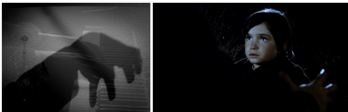
Figure 7. Transformation of the claw into the pianist's hand. La Morte Rouge . (Victor Erice, 2006). Nautilus Films.

the claw approaching Ana thus stands as a symbolic sentence-image of the catharsis of trauma that fictional creation achieves.